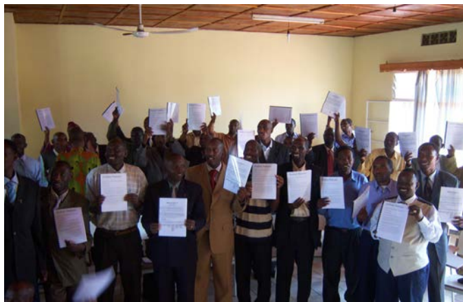
Training pastors and leaders in Kigali, Rwanda