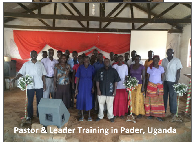
Pastor & Leader Training in Pader, Uganda