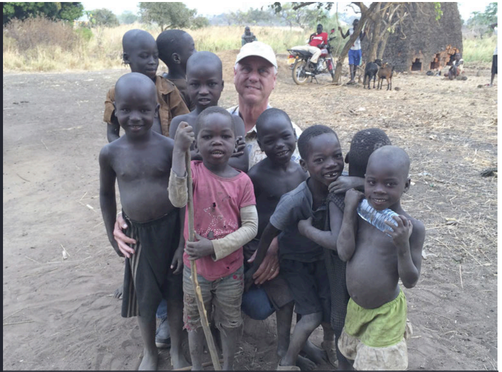
Kids in Gulu, Uganda

Train leaders. Disciple the nations. Reach the lost. Set captives free. Love on people, one person at a time, one day at a time.